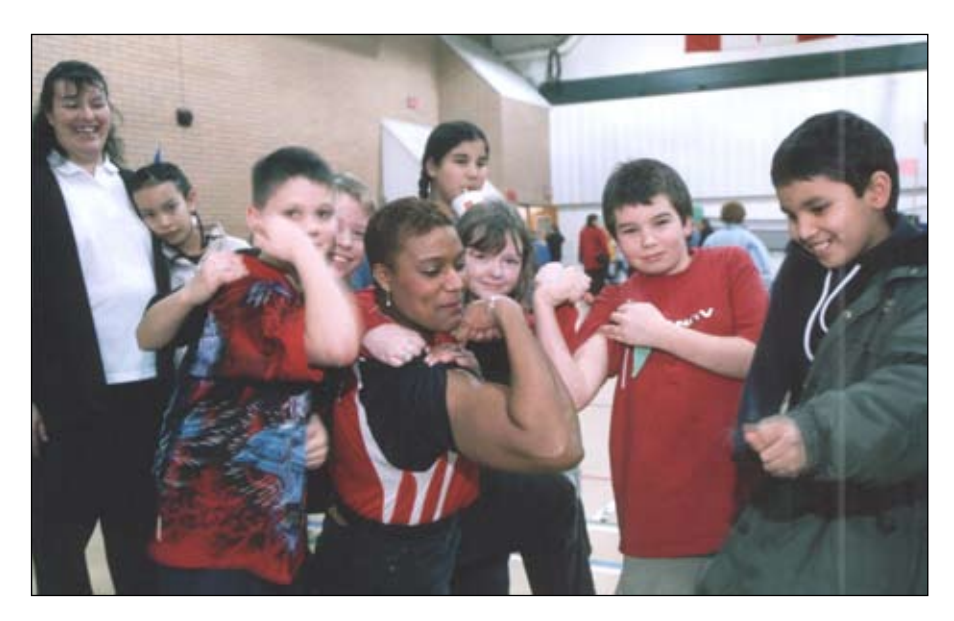
Georgette Reed, Olympian, inspires Slave Lake Grade 5 students.