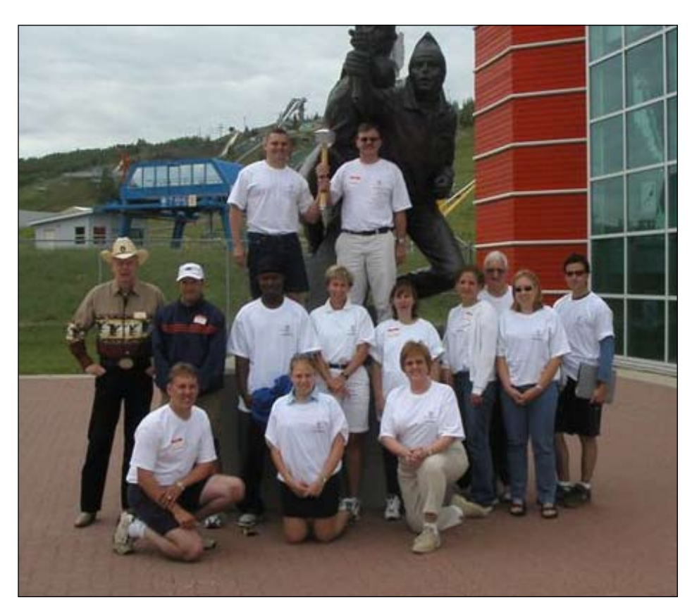
Participants of the 2004 Summer Institute with the 1988 Olympic Torch.

The Institute for Olympic Education also offers an intensive one-week summer institute on the theme of